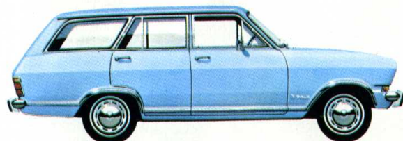
Kadett 5-door Estate