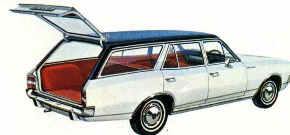
Rekord 5-door Estate