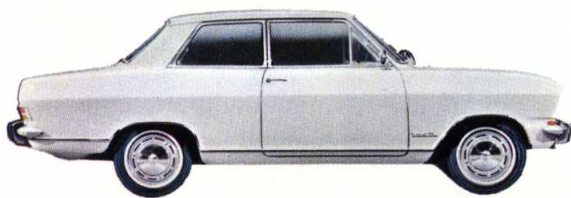
Kadett 2-door Saloon