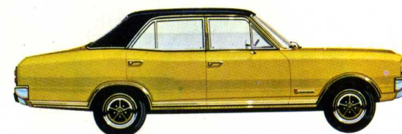
Commodore 4-door Saloon