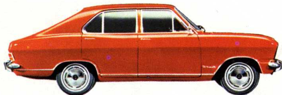
Kadett 4-door Fastback