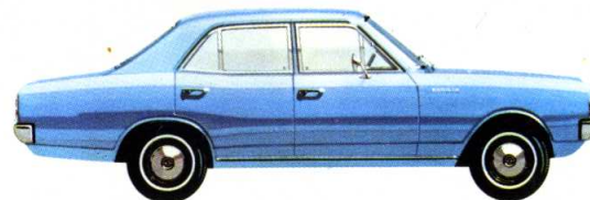
Rekord 4-door Saloon